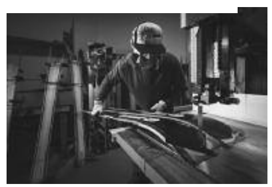
Meier everything from a narrow, frontside carver akin to a racing ski to allmountain skis to fat powder skis.